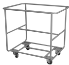
Plastic container supply with rack