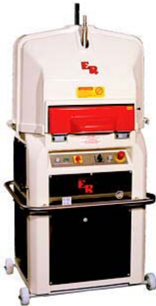
Shows machine with optional bumper guard and wheels.

In order to make our machine safer and faster, ERIKA has changed the outside appearance of its FULLY AUTOMAT. Its new name: